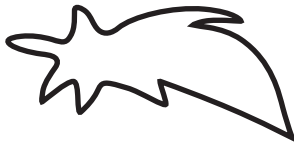
Ferb hair cut 2 from green paper or cardstock