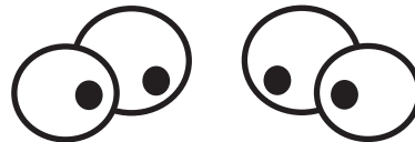
Ferb eyes cut out and use both sets