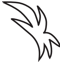
Phineas hair cut 2 from red paper or cardstock